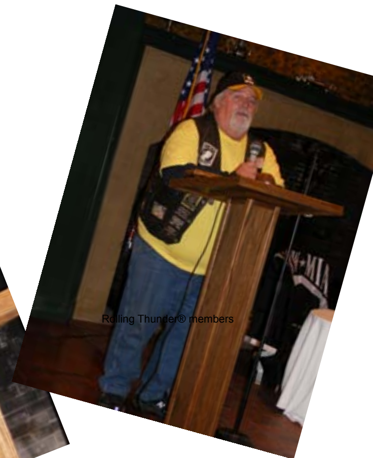
Rolling Thunder® members