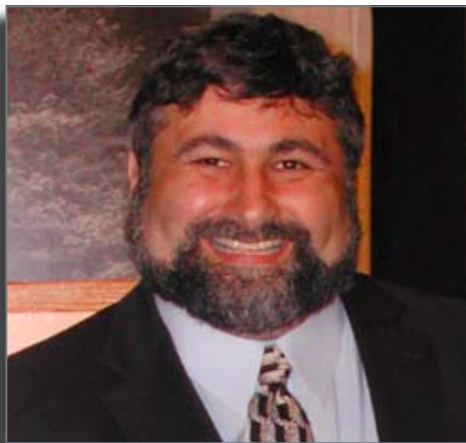
The medal was designed by Andre Belanger of Berlin, NH.

8. In the center of the pendant, "behind" the eagle, there is a black enamel panel with one polished, five-pointed star; the star is slightly larger than the nine stars on the oval of the pendant.